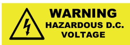
Example of sign on PV Array junction box (clause 5.3.2)