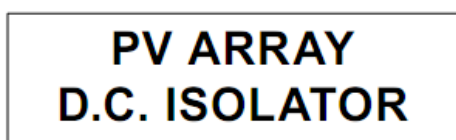
Example of sign required adjacent to PV Array D.C. isolator / switch-disconnector (clause 5.5.2)