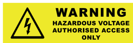
Example of authorized / restricted access only sign (clause 5.5.3)